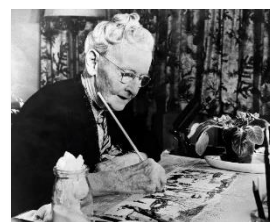
Year 2: Grandma Moses