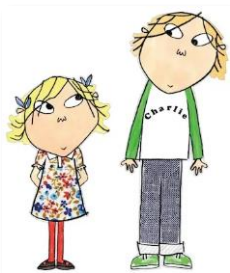
Reception: Charlie and Lola