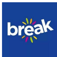
Year 1: The Break Charity