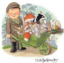
Reception – Percy the Park Keeper