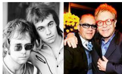
Year 2 – Elton John and Bernie Taupin Lyricist

Explore some Percy the Park Keeper stories at https://www.percytheparkkeeper.co.uk/pages/stories